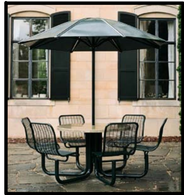
Campus Standard Table with or without umbrella